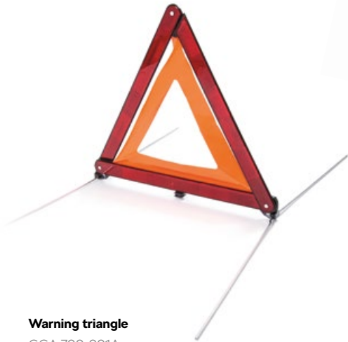
Warning triangle GGA 700 001A