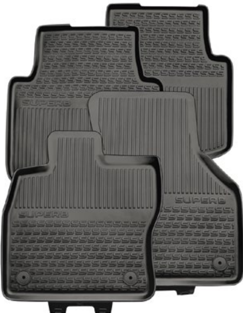
All-weather interior mats 3V1 061 551 | LHD Two-part front set 3V2 061 551 | RHD Two-part front set 3V0 061 551 | Two-part rear set