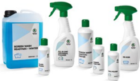
Car cosmetic For the details check our car cosmetics catalogue (QR code on the left).