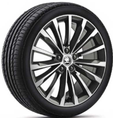
TRINITY 3VO 071 499F HA7 light-alloy wheel 8.0J x 19" ET44 for 235/40 R19 tyre anthracite metallic brushed