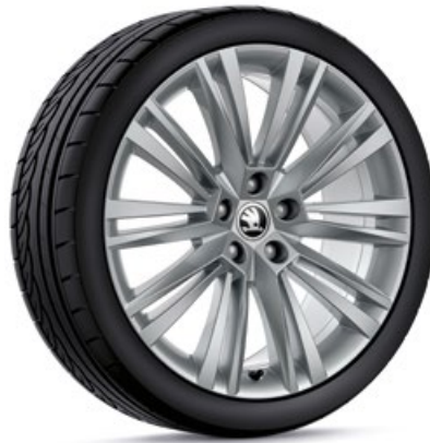
CANOPUS 3VO 071 499P 8Z8 light-alloy wheel 8.0J x 19" ET44 for 235/40 R19 tyre silver metallic