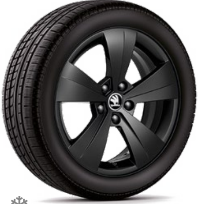
❄️ TRITON 3V0 071 497B FL8 light-alloy wheel 6.5J x 17" ET41 for 215/55 R17 tyre black metallic