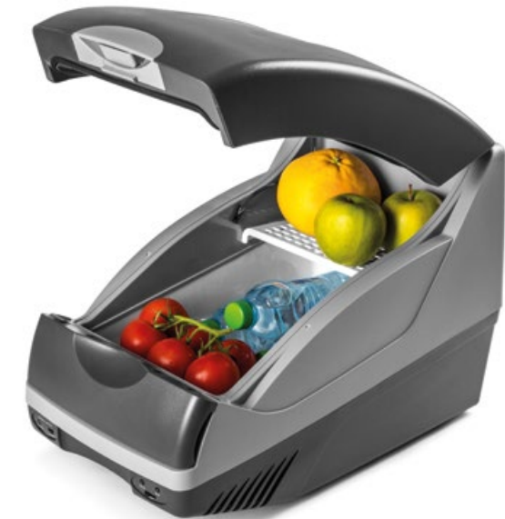
Thermo-electric cooling box (15L) 5LO 065 400