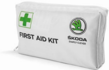
First aid box 3T0 093 108B Photo is only illustrative. Each country should use the photo and the number of the local first aid box.