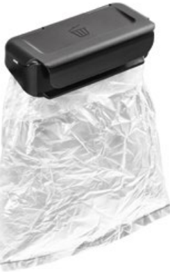
Bin for door panel

5JA 061 107 9B9 | black 5JA 061 107 WC4 | beige