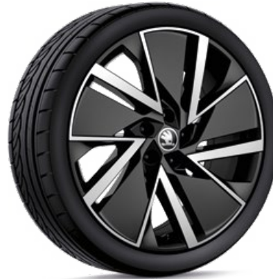
VEGA AERO 3V0 071 499T FL8 light-alloy wheel 8.0J x 19" ET44 for 235/40 R19 tyre black metallic brushed