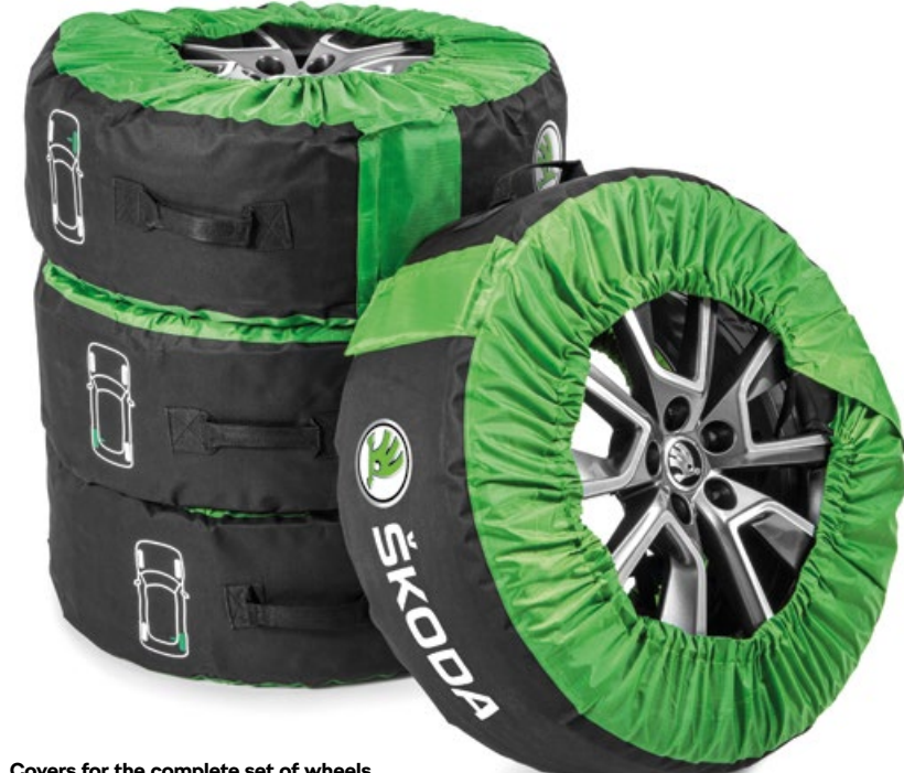
Covers for the complete set of wheels 000 073 900B *with ŠKODA logo available later