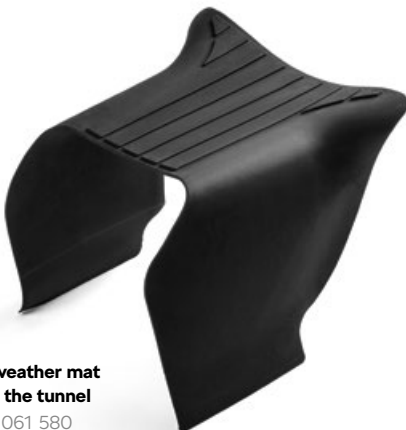
All-weather mat over the tunnel 3V0 061 580