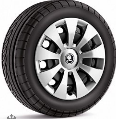
❄️ HERMES 3V0 071 456 steel wheel 6.5J x 16" ET41 for 215/60 R16 tyre