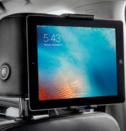
Smart holder – hook