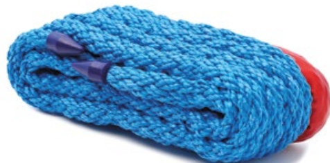
Tow rope GAA 500 001