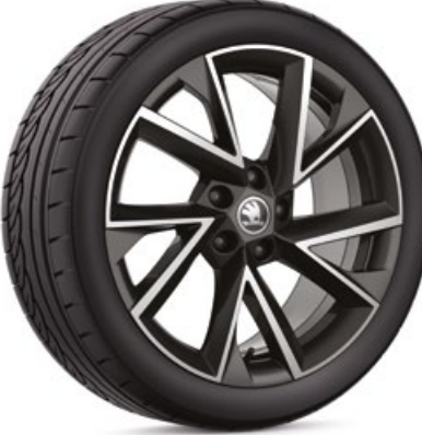
VELA 3V0 071 498P FL8 light-alloy wheel 8.0J x 18" ET44 for 235/45 R18 tyre black metallic brushed