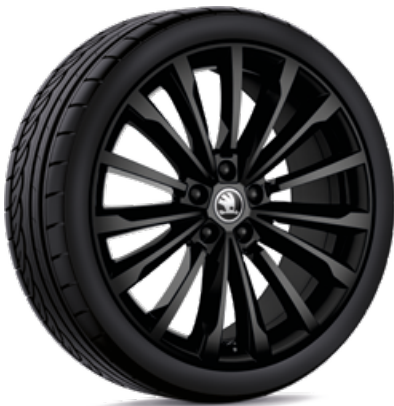
TRINITY 3VO 071 499K JX2 light-alloy wheel 8.0J x 19" ET44 for 235/40 R19 tyre black gloss