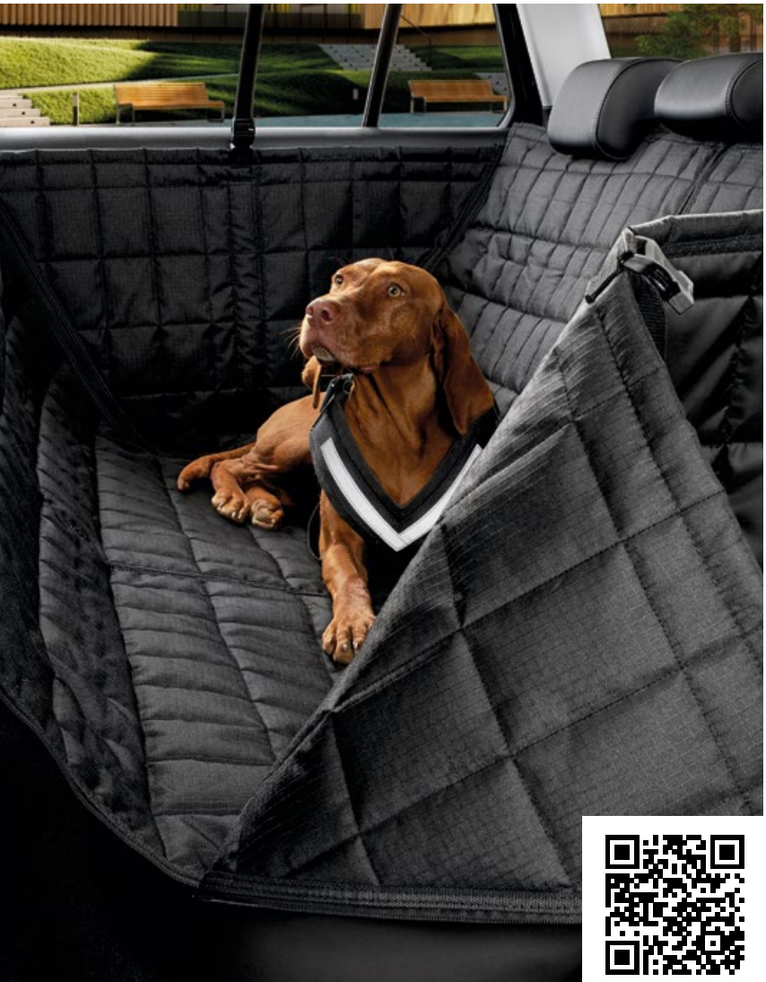
Back seat protection 3VO 061 680