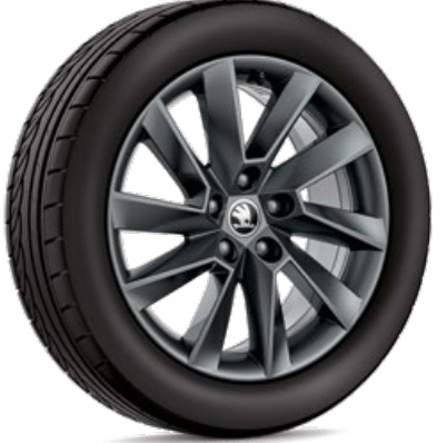
STRATOS 3V0 071 497H HA7 light-alloy wheel 7.0J x 17" ET40 for 215/55 R17 tyre anthracite metallic