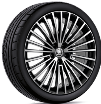
CEPEUS 3V0 071 499N FL8 light-alloy wheel 8.0J x 19" ET44 for 235/40 R19 tyre black metallic brushed