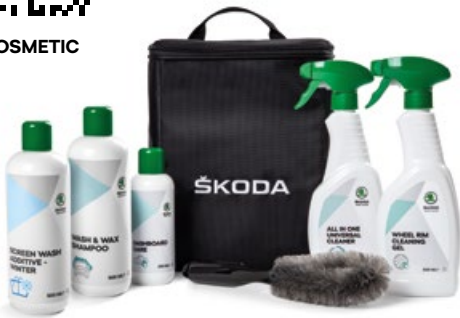
Car cosmetic kit 000 096 356F