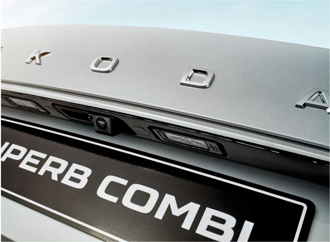
Rear view camera 3VO 054 634E for SUPERB COMBI, LHD available soon