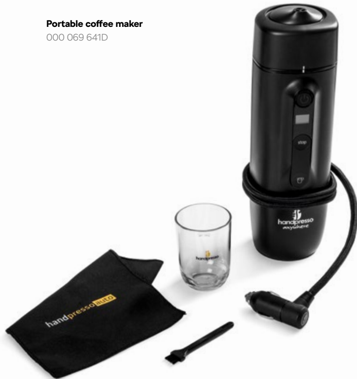
Portable coffee maker 000 069 641D