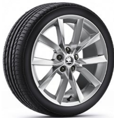
MODUS 3VO 071 498F 8Z8 light-alloy wheel 8.0J x 18" ET44 for 235/45 R18 tyre silver metallic