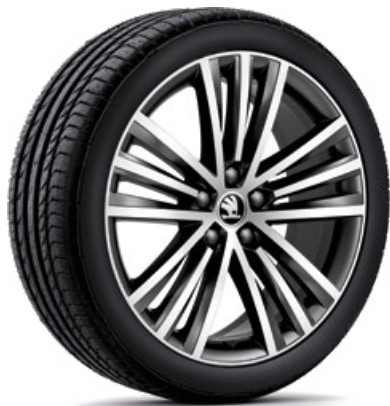
SIRIUS 3VO 071 499B HA7 light-alloy wheel 8.0J x 19" ET44 for 235/40 R19 tyre anthracite metallic brushed