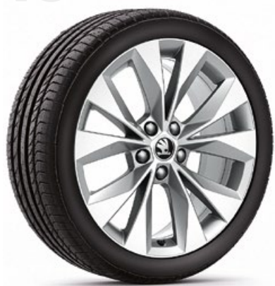
CASSIOPEIA 3VO 071 498B 8Z8 light-alloy wheel 8.0J x 18" ET44 for 235/45 R18 tyre silver metallic brushed