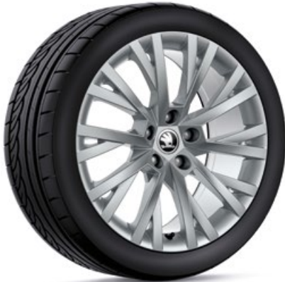
ANTARES 3V0 071 498J 8Z8 light-alloy wheel 8.0J x 18" ET44 for 235/45 R18 tyre silver metallic