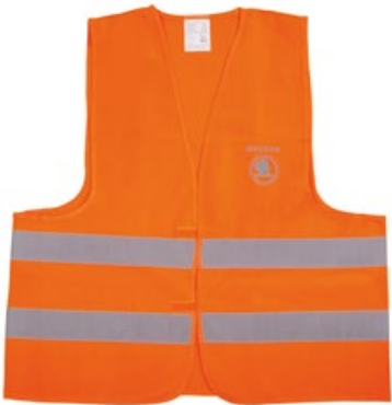
Reflective safety vest 000 093 056L | yellow 000 093 056K | orange Photo is only illustrative. Each country should use the photo of the local reflective safety vest.