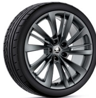
ACAMAR 3V0 071 499J HA7 light-alloy wheel 8.0J x 19" ET44 for 235/40 R19 tyre anthracite metallic