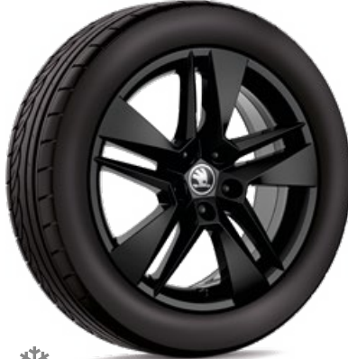
❄️ MARKAB 3V0 071 497G FL8 light-alloy wheel 6.5J x 17" ET41 for 215/55 R17 tyre black metallic