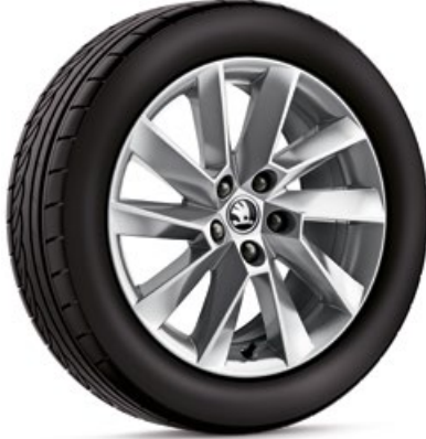
STRATOS 3V0 071 497D 8Z8 light-alloy wheel 7.0J x 17" ET40 for 215/55 R17 tyre silver metallic