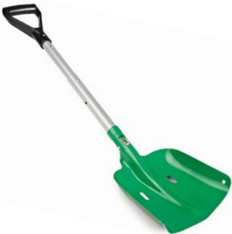
Foldable snow shovel 5L0 099 320