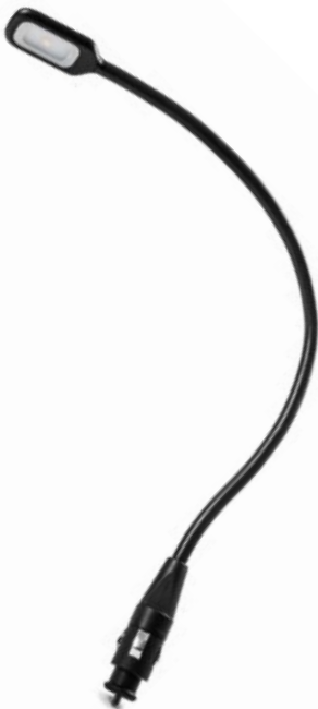
LED reading lamp (12V) 000 069 690L