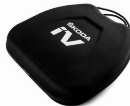
Bag for charging cables

The MODE 2 cable is a great solution for customers who need to charge their car from regular „home“ socket. The cable length is 6m (including the charging case).