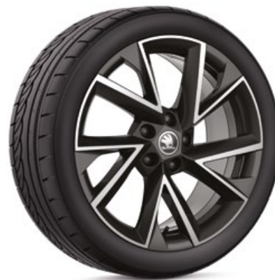
VEGA 3V0 071 499G HA7 light-alloy wheel 8.0J x 19" ET44 for 235/40 R19 tyre anthracite metallic brushed