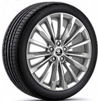
TRINITY 3VO 071 499H 3AJ light-alloy wheel 8.0J x 19" ET44 for 235/40 R19 tyre high gloss