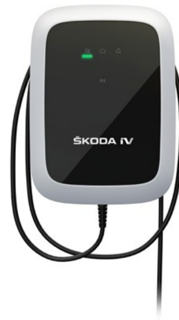
ŠKODA iV Charger ŠKODA iV Charger Connect ŠKODA iV Charger Connect+ Powered by Elli ⚡

the offer and method of purchase varies by country