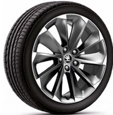
SUPERNOVA 3V0 071 499A HA7 light-alloy wheel 8.0J x 19" ET44 for 235/40 R19 tyre anthracite metallic brushed