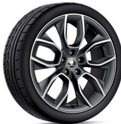
CRATER 3V0 071 499S HA7 light-alloy wheel 8.0J x 19" ET44 for 235/40 R19 tyre anthracite metallic brushed