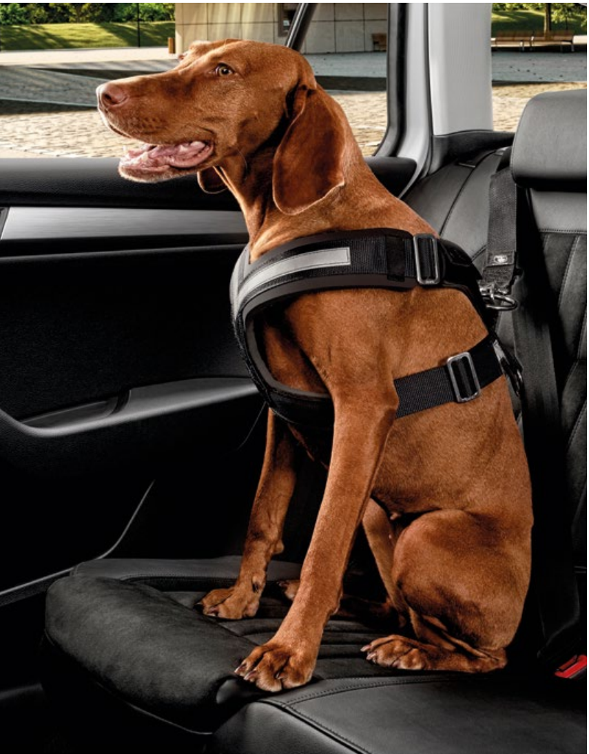
Dog safety belt 000 019 409A (S), 000 019 409B (M), 000 019 409C (L), 000 019 409D (XL)