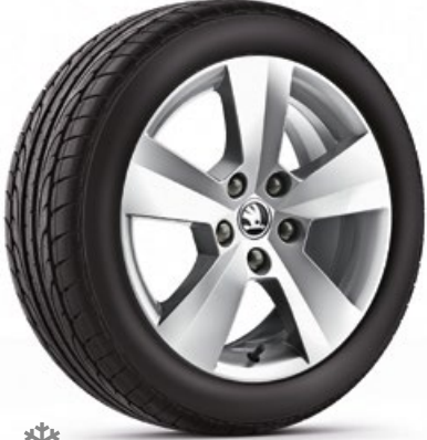
❄️ ORION 3V0 071 496 8Z8 light-alloy wheel 6.5J x 16" ET41 for 215/60 R16 tyre silver metallic