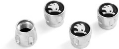
Decorative valve caps 000 071 215C