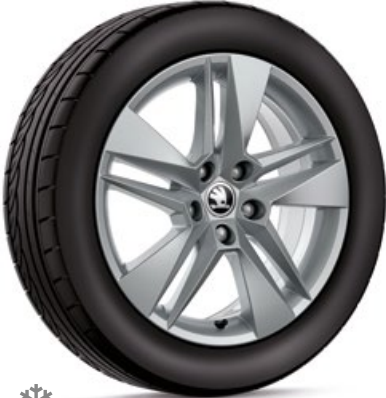
❄️ MARKAB 3V0 071 497F 8Z8 light-alloy wheel 6.5J x 17" ET41 for 215/55 R17 tyre silver metallic