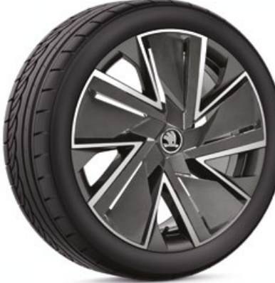
VELA WHEEL COVER 3V0 071 213 Aero wheel cover for 18" brushed alloy wheel VELA black gloss