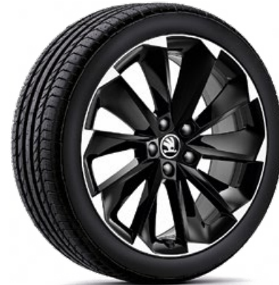
SUPERNOVA 3V0 071 499 JX2 light-alloy wheel 8.0J x 19" ET44 for 235/40 R19 tyre black gloss brushed