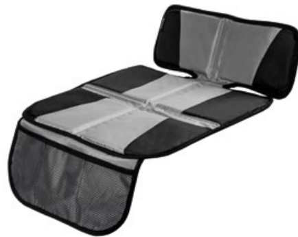
Protective pad under the child seat 000 019 819A