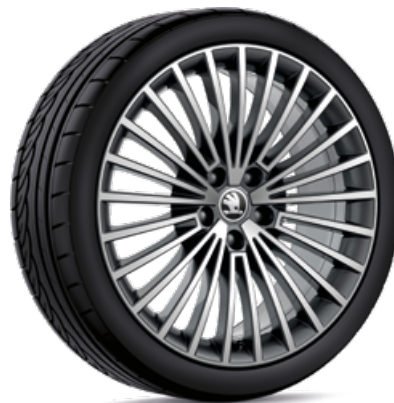
CEPEUS 3V0 071 499M HA7 light-alloy wheel 8.0J x 19" ET44 for 235/40 R19 tyre anthracite metallic brushed