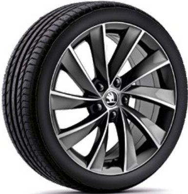
PEGASUS 3V0 071 498H HA7 light-alloy wheel 8.0J x 18" ET44 for 235/45 R18 tyre anthracite metallic brushed