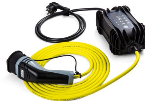
Cable for home charging

[here paste the link to your wallbox e-shop]