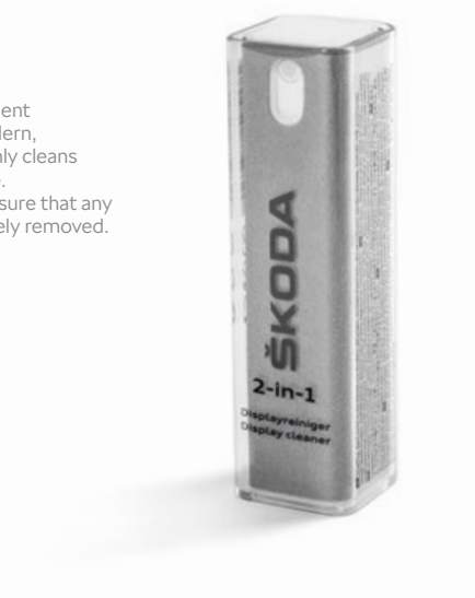
2-in-1 Refill pack 000 096 311AA

This practical set comprises a cleaning agent and a high-quality cleaning cloth in a modern, minimalist design – a 2-in-1 that thoroughly cleans the screen, keeping it looking impeccable. The cleaning fluid and microfibre cloth ensure that any dirt or annoying fingerprints are completely removed.