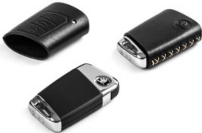
Leather key cover

5JA 061 107 9B9 | black 5JA 061 107 WC4 | beige