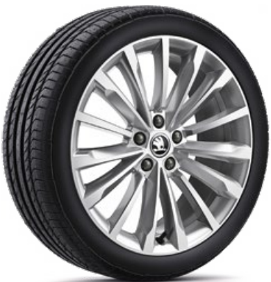
TRINITY 3VO 071 499E 8Z8 light-alloy wheel 8.0J x 19" ET44 for 235/40 R19 tyre silver metallic