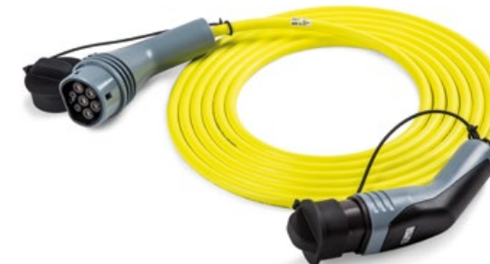
Cable for public charging

The charger cable cleaner is used for cleaning and/or drying the cable before placing it in the interior of the car or a bag.