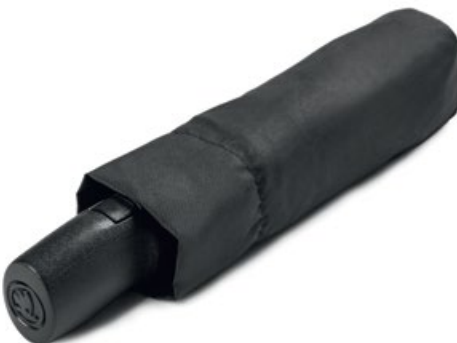
Umbrella 000 087 600G 9B9