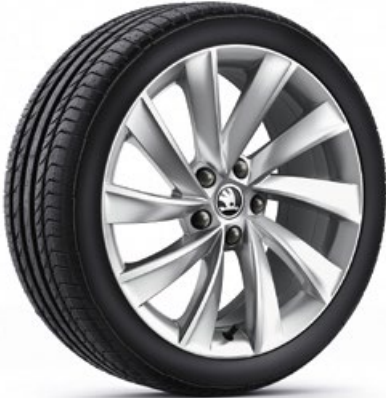
PEGASUS 3V0 071 498G 8Z8 light-alloy wheel 8.0J x 18" ET44 for 235/45 R18 tyre silver metallic