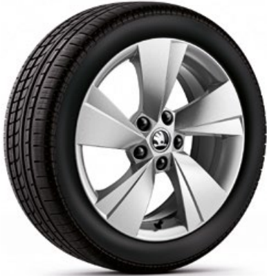
ZEUS 3V0 071 497C 8Z8 light-alloy wheel 7.0J x 17" ET40 for 215/55 R17 tyre silver metallic