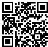
ALLOY WHEELS VIDEO