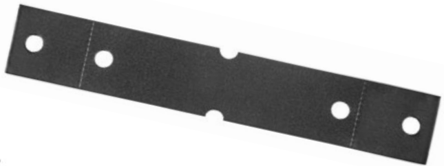
License plate pad KEA 075 004