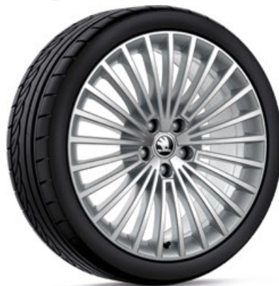
CEPEUS 3V0 071 499L 8Z8 light-alloy wheel 8.0J x 19" ET44 for 235/40 R19 tyre silver metallic brushed