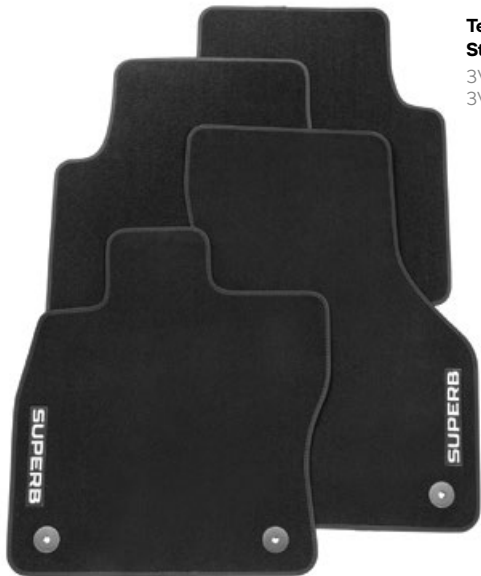
Textile foot mats Standard (4-piece) 3V1 061 404B | LHD 3V2 061 404B | RHD