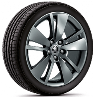
ZENITH 3VO 071 498C HA7 light-alloy wheel 8.0J x 18" ET44 for 235/45 R18 tyre anthracite metallic