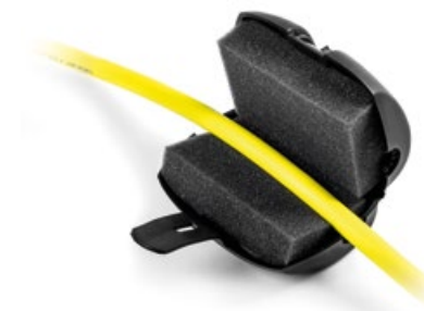
Cleaner for charging cables

A practical accessory for any electric car, used for carrying the charging cable.