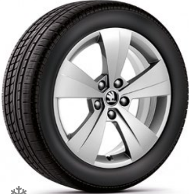
❄️ TRITON 3V0 071 497 8Z8 light-alloy wheel 6.5J x 17" ET41 for 215/55 R17 tyre silver metallic