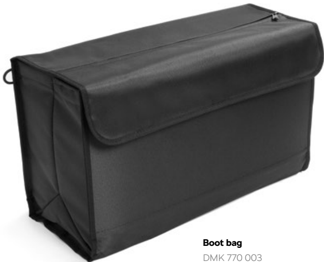
Boot bag DMK 770 003