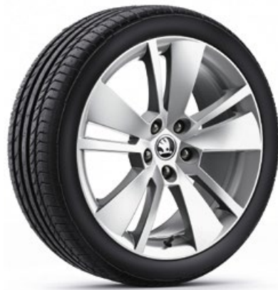
ZENITH 3VO 071 498E 8Z8 light-alloy wheel 8.0J x 18" ET44 for 235/45 R18 tyre silver metallic