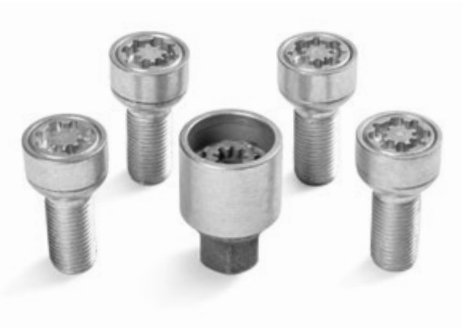
Safety bolt set 000 071 597C