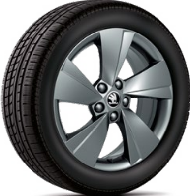
ZEUS 3V0 071 497A HA7 light-alloy wheel 7.0J x 17" ET40 for 215/55 R17 tyre anthracite metallic