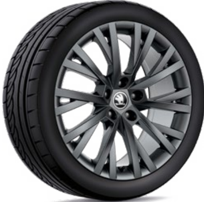
ANTARES 3V0 071 498K HA7 light-alloy wheel 8.0J x 18" ET44 for 235/45 R18 tyre anthracite metallic