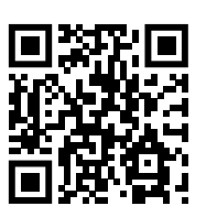
BIKE RACK VIDEO